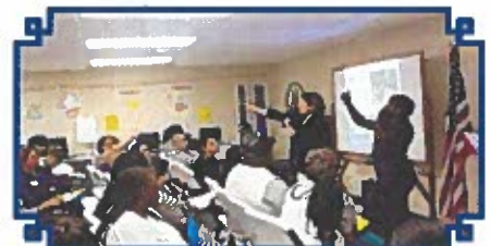
Residents should ask about any impacts converting to Section 8 may have on their rent, repairs that might be done on the property, and whether residents will need to be relocated temporarily.

PHA Plan. Note that in addition to meeting with residents of the converting project, a PHA must also amend its PHA Plan to reflect the proposed RAD conversion and solicit community input. As part of this process, a PHA will hold separate public meetings and collect comments.