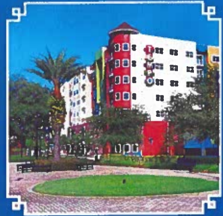
The Tempo at Encore, Tempo Housing Authority

Public Housing Agencies (PHAs) use the Rental Assistance Demonstration (RAD) Program to preserve affordable housing and improve properties by "converting" their form of federal assistance to the Section 8 program. PHAs choose to convert to either: Section 8 project-based voucher (PBV) or Section 8 project-based rental assistance (PBRA).